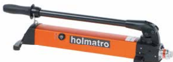
PA 09 H 2 C