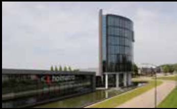
Holmatro Group World Headquarters Raamsdonksveer, The Netherlands