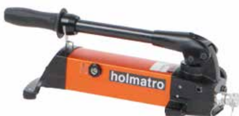
PA 04 H 2 S