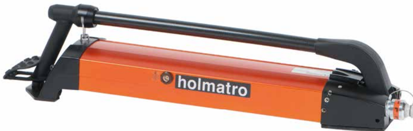
PA 18 F 2 C