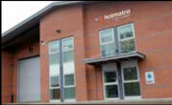
Holmatro UK Nottingham, UK Sales & service