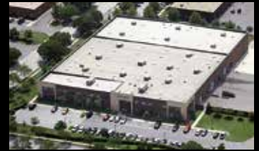
Holmatro USA Glen Burnie, MD, U.S.A. Manufacturing, sales & service