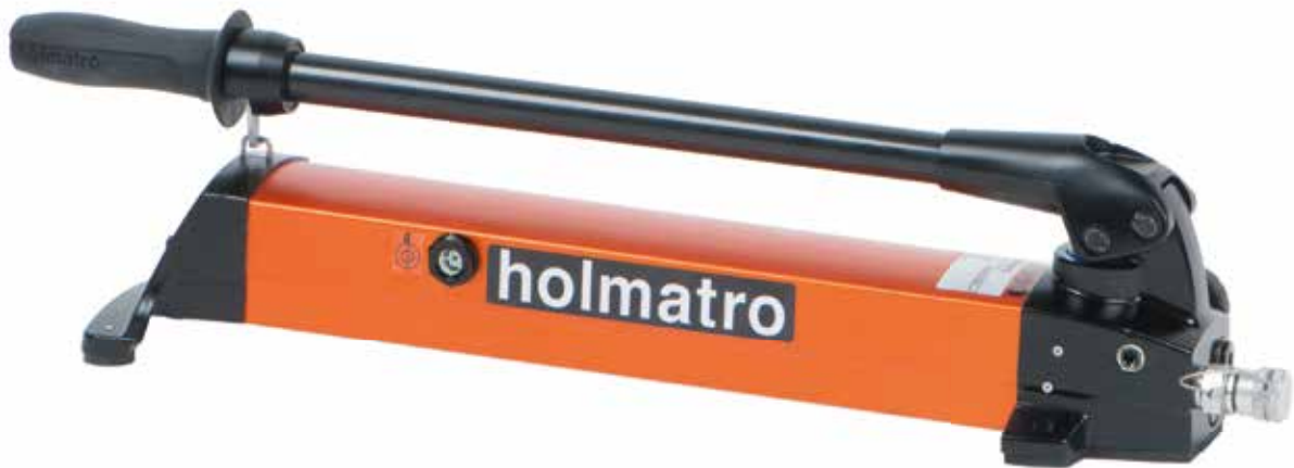
PA 09 H 2 S