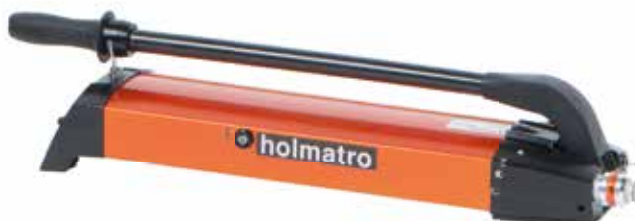
PA 18 H 2 C