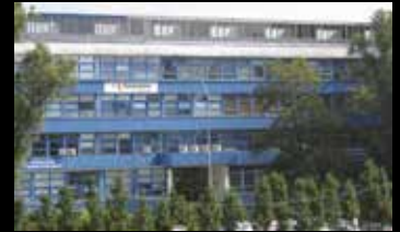
Holmatro Poland Warsaw, Poland Sales & service