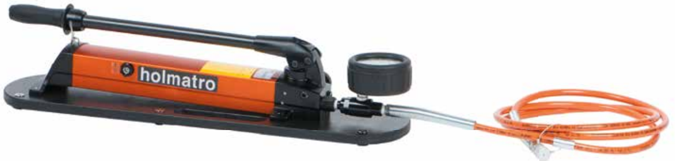
PA 09 H 2 S 10