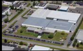
Holmatro Netherlands Rescue equipment Raamsdonksveer, The Netherlands T +31 (0)162 58 92 00 E rescue@holmatro.com Manufacturing, sales & service