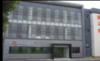
Holmatro China Suzhou, Jiangsu Province, China Sales & service