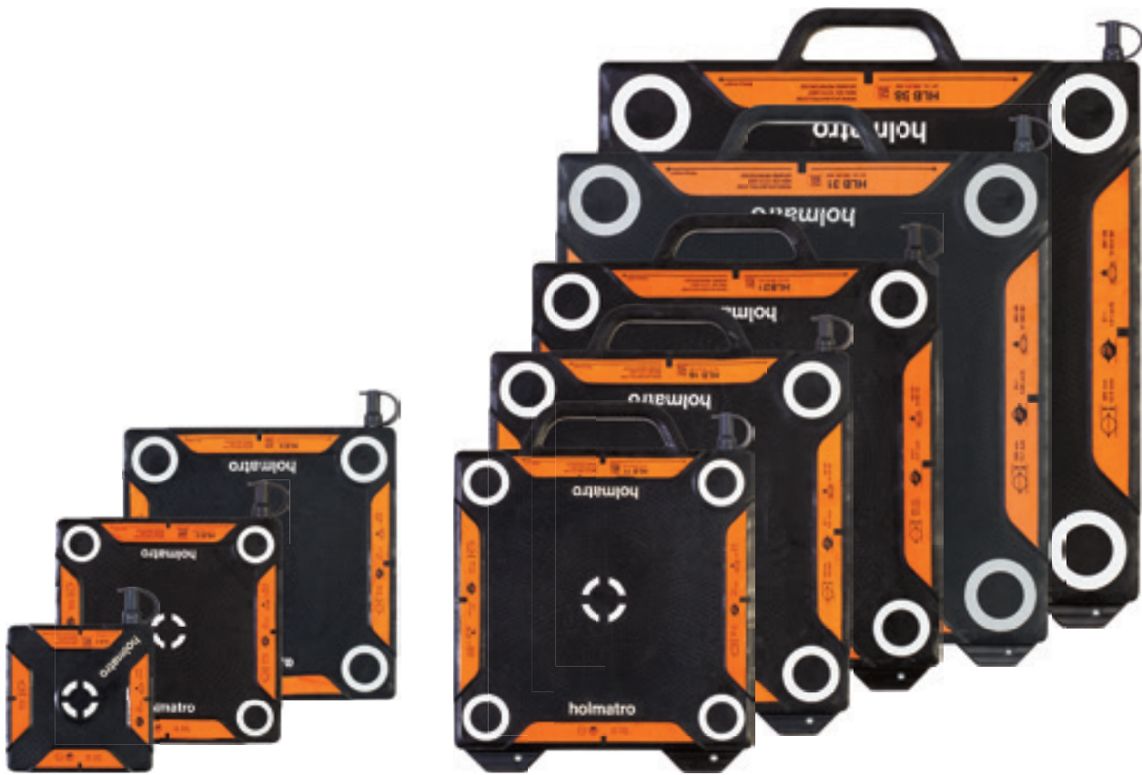
SMALL HLB 2 HLB 6 HLB 8

Choose your lifting bag: with a 50% increase in power you can get the same job done using a smaller and lighter model.