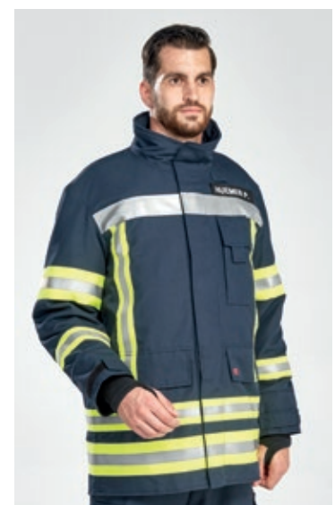
Protective jacket with "HuPF"-style striping