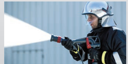
30° narrow spray